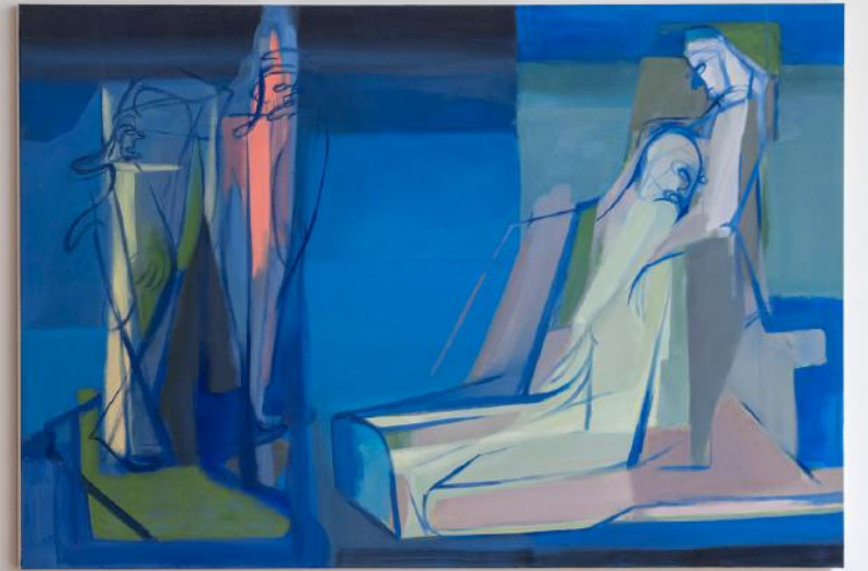
Jamie Gray Williams, The Lips, the Teeth, the Tip of the Tongue , Installation View, 2024