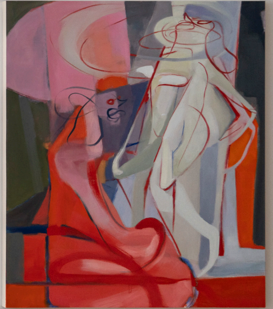
Jamie Gray Williams, The Lips, the Teeth, the Tip of the Tongue , Installation View, 2024