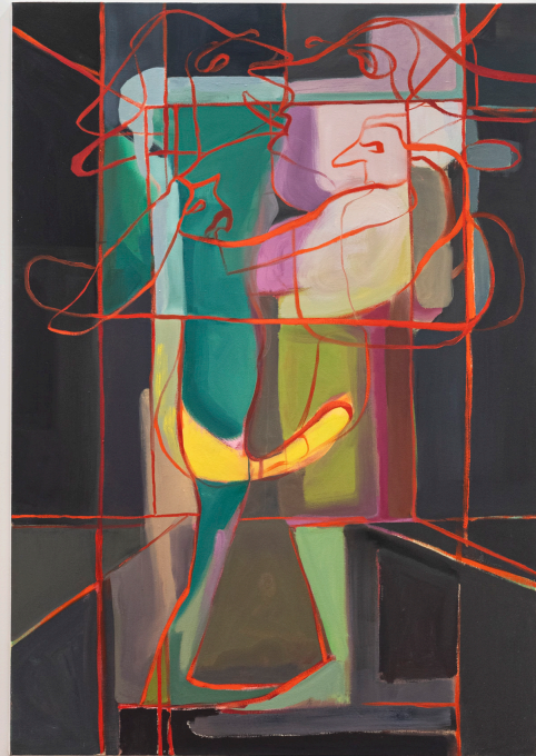
Right: Jamie Gray Williams Nervous Systems, 2024 Acrylic and oil on canvas 60 × 42 in