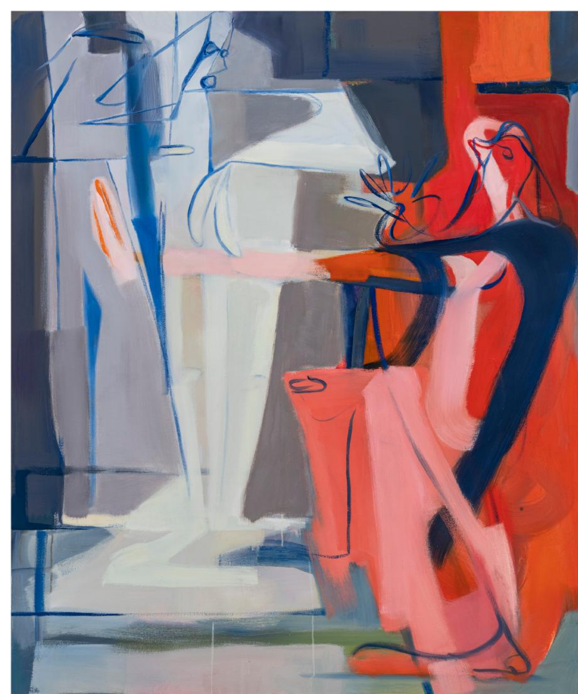
Jamie Gray Williams The Hand Refrains (Pygmalion), 2024 Acrylic and oil on canvas 60 × 50 in