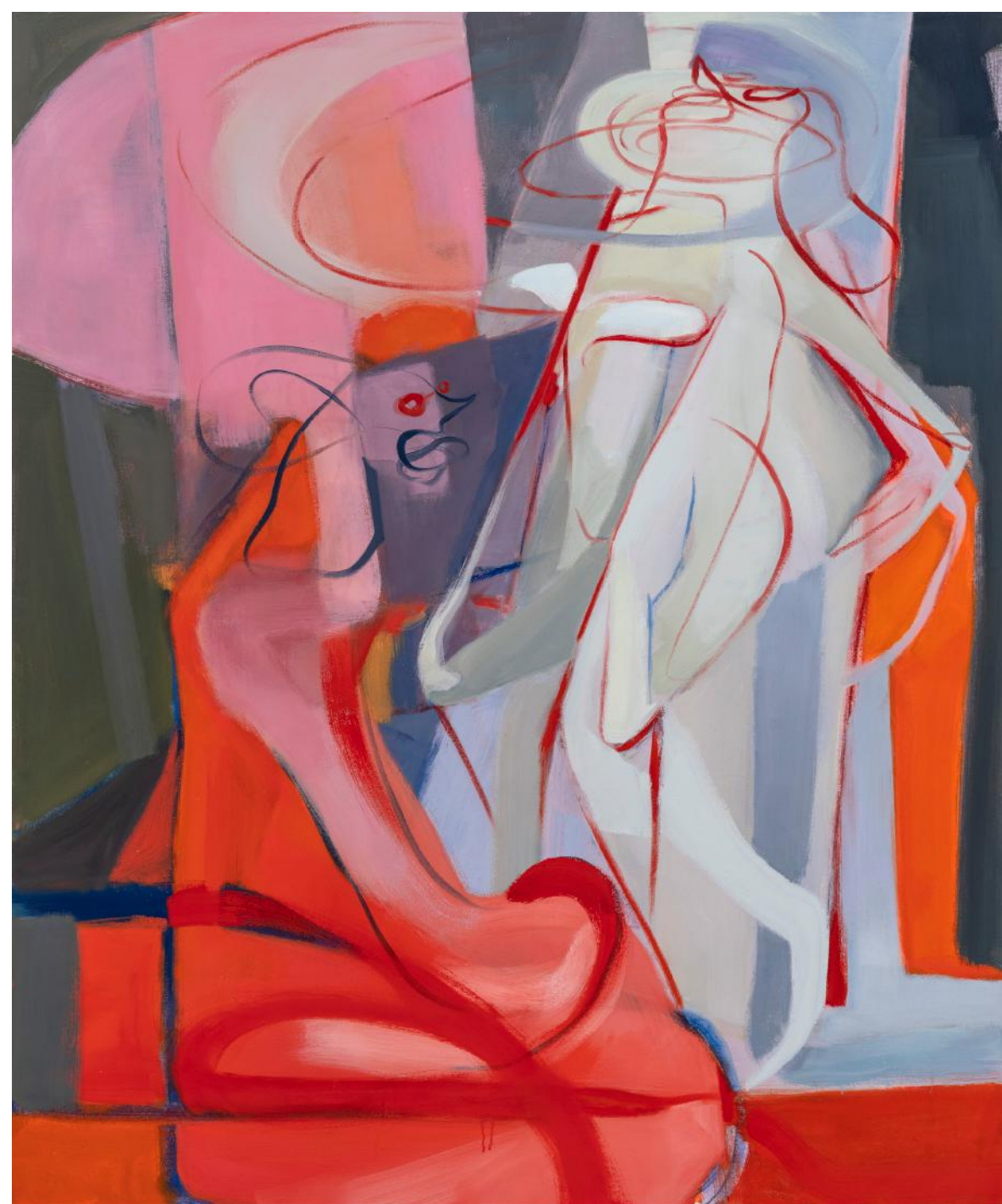
Jamie Gray Williams The Godhead Fires (Pygmalion), 2024 Acrylic and oil on canvas 60 × 50 in